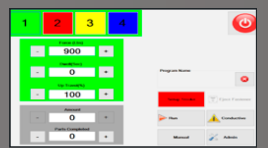
Multi-Station: Multi-Station is an option that allows the operator to insert more than one fastener in a program. Each station can be configured to have its own individual Force, Dwell Time and Up Travel.