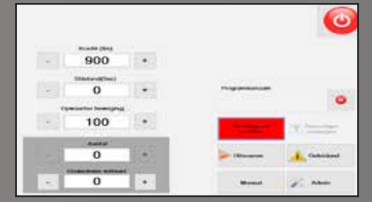
Single Station settings: Operators can set the Force, Dwell and Up Travel from this single